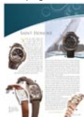
One page brand listing