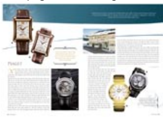
Two pages brand listing